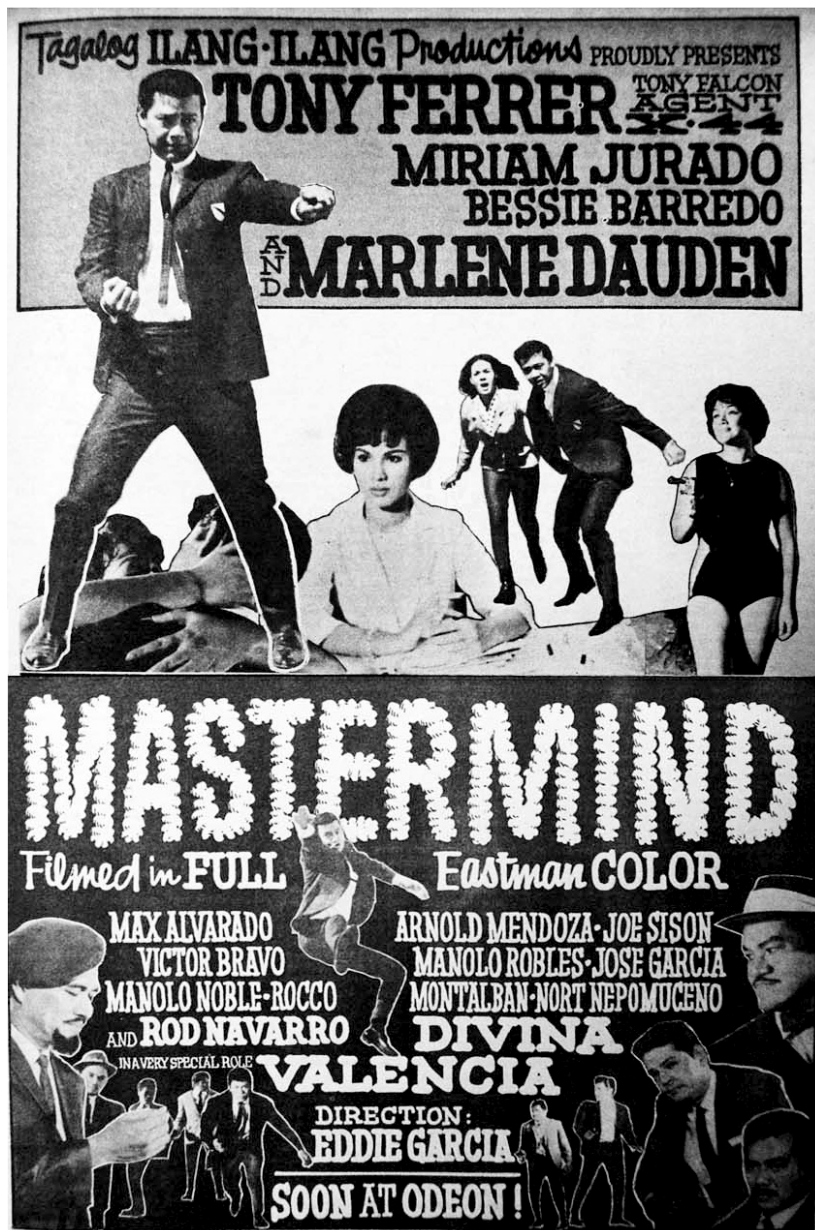
Fig. 2. Movie poster, Mastermind (1965).